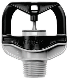
Rotor Rain® Plus PC 3/8" Male Thread