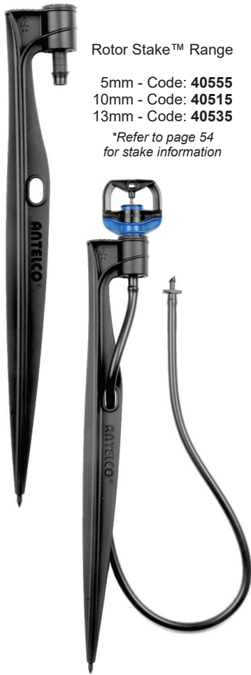
Rotor Stake™ Range

5mm - Code: 40555 10mm - Code: 40515 13mm - Code: 40535