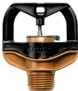
Rotor Rain® Plus PC with Deflector 3/8" Male Thread