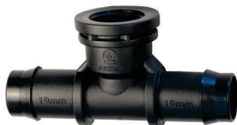
Threaded Tee Female