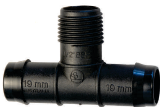
Threaded Tee Male