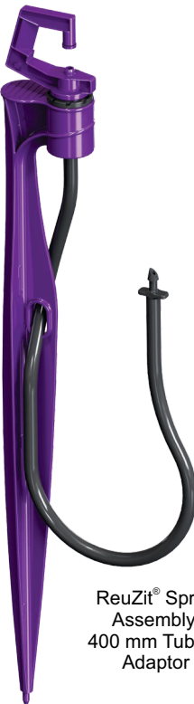
ReuZit® Spray Assembly, 400 mm Tube & Adaptor