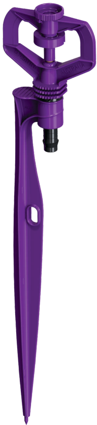
ReuZit® Sprinkler Assembly with Stake 13 mm inlet