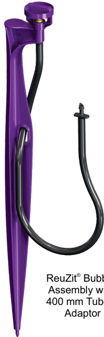
ReuZit® Bubbler Assembly with, 400 mm Tube & Adaptor