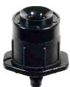
Spectrum™ Thread 4 mm