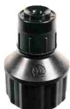
Spectrum™ Thread 1/2" Female