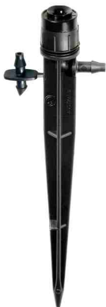
Spectrum™ Spike Inlet 4 mm