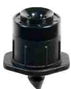
Spectrum™ Barb 4 mm