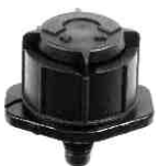
Mini Bubbler Thread 4 mm