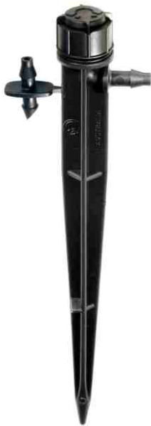
Mini Bubbler Spike Inlet 4 mm