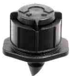
Mini Bubbler Barb 4 mm