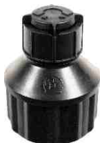
Mini Bubbler Thread 1/2" Female