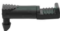
Midi Drip™ Barb 4 mm