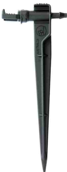
Midi Drip™ Spike 4 mm