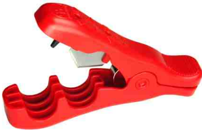
2 in 1 Punch & Cutter