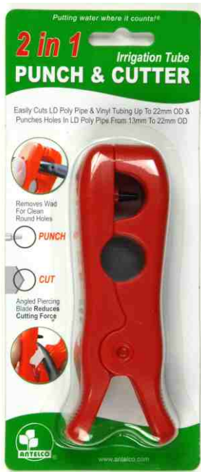
2 in 1 Punch & Cutter Retail Packaging