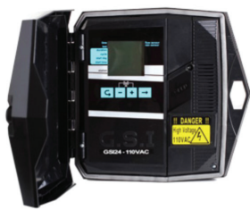
Irrigation Controller AC or DC

Using your existing AC or DC irrigation controller, hardwire from your station outputs to the Gator Master Module input terminals and then use data cable to connect to transmitter.