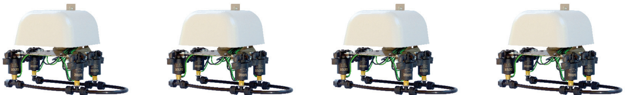
GATOR RADIO RECEIVERS LOCATED AT THE POSITION OF THE DEVICE/S TO BE CONTROLLED

Note: we would always recommend that a site survey be conducted to ensure a good signal strength to all receiver locations.