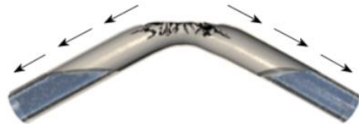
Pipeline Without Kinetic Vacuum Valve with water draining