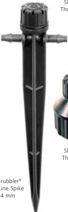
Shrubbler® In-Line Spike 4 mm