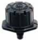
Shrubbler® Thread 4 mm