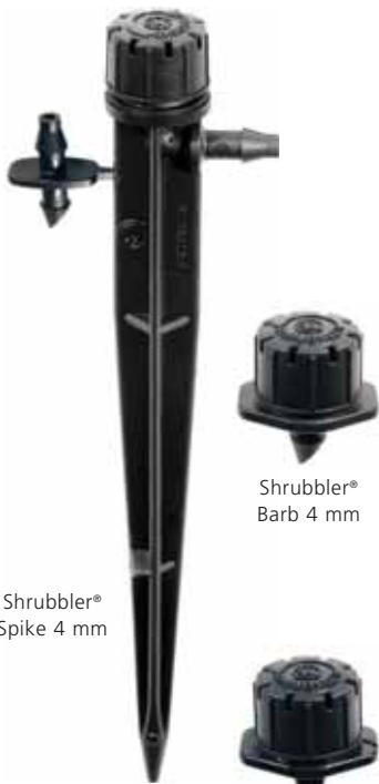
Shrubbler® Spike 4 mm