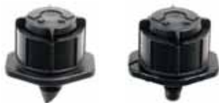
Mini Bubbler Barb 4 mm