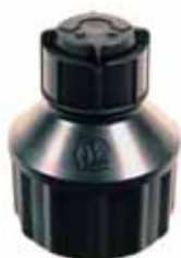
Mini Bubbler Thread 1/2"