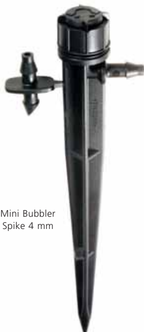
Mini Bubbler Spike 4 mm