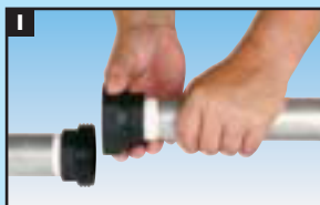
1. Disconnect current pipe