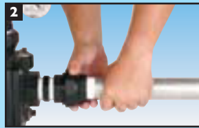
2. Connect new pipe to pump.