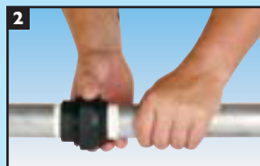
2. Connect new pipe to pump.