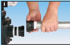
1. Disconnect current pipe from pump.